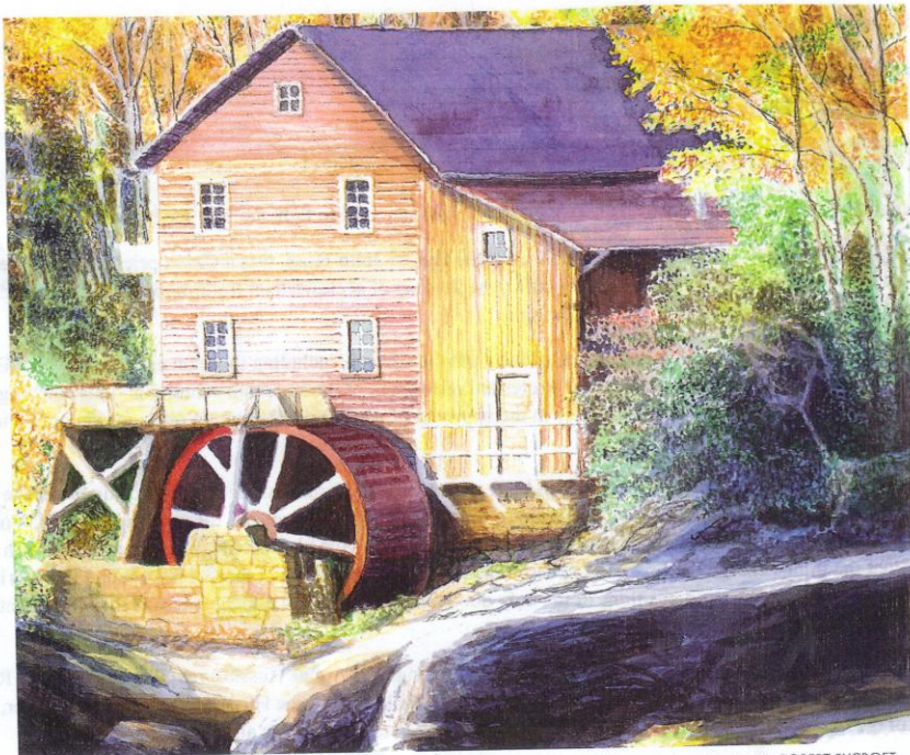
SERENITY OF AUTUMN

"THE GRASS WITHERETH, THE FLOWER FADETH: BUT THE WORD OF OUR GOD SHALL STAND FOREVER." Isaiah 40: 8